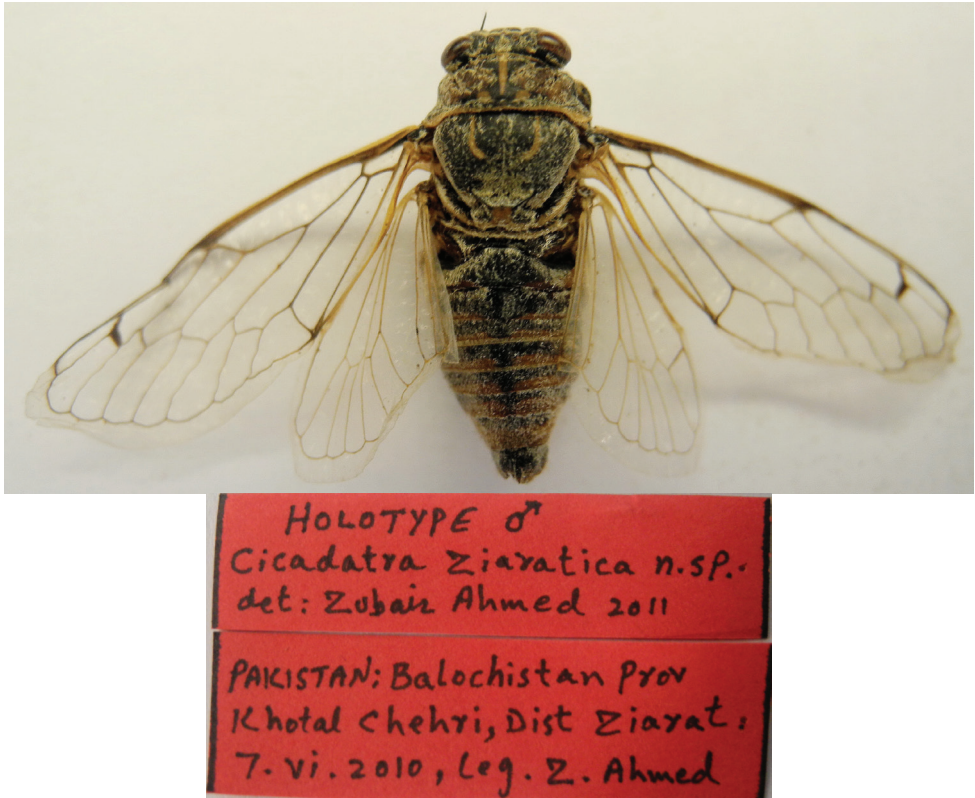
Figure 1. Holotype Male, Cicadatra ziaratica sp. n.

(NHMK); one male paratype, “Pakistan, Balochistan Province, Khotal Chehri, District Ziarat, 7.vi.2010, Collector, Zubair Ahmed”, “PARATYPE / Cicadatra ziaratica / Ahmed, Sanborn & Akhter” [handwritten label]; three male paratypes, “Pakistan, Balochistan Province, Khotal Chehri, District Ziarat, N, 3.vi.2011, Collector, Zubair Ahmed “PARATYPE / Cicadatra ziaratica / Ahmed, Sanborn & Akhter” [handwritten label] (ZACP).